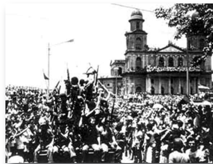
Sandinistas rally during early 80s.

We must never forget that the Jesuits took a special vow of obedience and nothing was forbidden if done for “ the greater glory of God .” They were champions of the doctrine that “ the end justifies the means .” This meant that it was permissible, even desirable, to lie, cheat, steal, prevaricate, dissemble, even murder if the end justified it. This is history. No wonder the Jesuits were expelled by the Japanese, Chinese, British, Mexicans, and a host of other nations who found the presence of those arch Papists a dire threat to life and liberty.