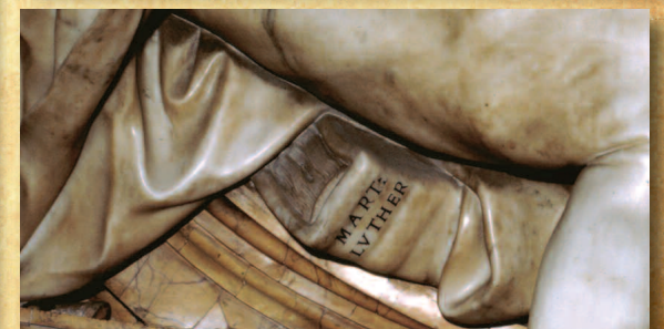
A woman representing the Roman Church holds in one hand a cross and in the other flames of persecution. She casts down the Protestant Reformers.