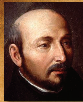
Ignatius of Loyola

The Jesuits are famous in Church history. Founded by the Spanish Ignatius of Loyola, this order of Papal zealots has been feared by kings, governments, cardinals, and even by Popes. The leader of the Jesuits is called the "Black Pope" and so great is his power that even the Vatican thinks twice before crossing him.