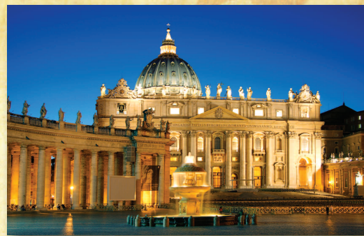
St. Peter's Cathedral

The new Pope hails from Catholic Argentina and has taken the name Francis, after the great Catholic saint who was noted for his simplicity, humility and love for the poor. He is the first Jesuit in history to assume the Papal throne with all its trappings of power. He has made a good start, shunning the papal limo for a minibus and personally visiting the hotel where he had been staying to pay his bill.