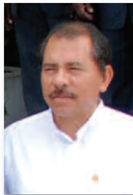
Jose Daniel Ortega Saavedra, President of Nicaraguan Sandinistas

In more recent times, it appears that amazing changes have taken place within the formidable walls of their venerable institutions. A revolution against the Roman hierarchy has been hatched in the fertile minds of many Jesuit scholars who believe that the Roman hierarchy is actually against the “People of God.”* Protestant missionaries in Latin America have been astounded to find Jesuits working against the official Roman Catholic Church and encouraging the reading of the Bible. You may recall the events in Nicaragua where the Contras were pitched against the Sandinistas. The Contras, ardent supporters of the Pope, were armed by the United States of America. The Sandinistas were Marxist revolutionaries who preached “ Liberation Theology ” that they got from the Jesuits, their partners in their violent struggle against so-called “ American Imperialism .” Strange happenings indeed!