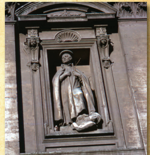
Martin Luther trampled by Ignatius of Loyola