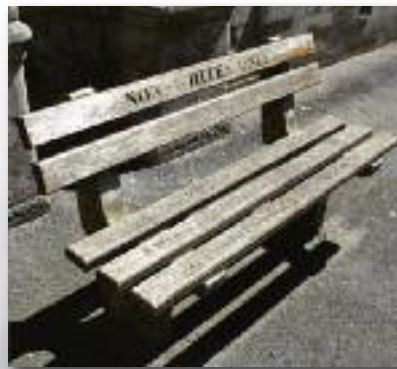
Bench reserved for "non-whites only" outside a public building in Cape Town