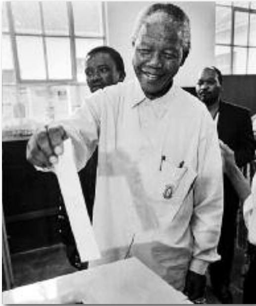
Mandela casting his vote in the 1994 election

Many expected a blood bath when Mandela and his African National Council got control of the country, but it didn't happen. President Nelson Mandela said, "I forgive you. Please stay and let us together build a nation of equal opportunity for all." * This was Mandela's miracle. It was the reason the people — whites, blacks and coloreds — loved him so. Unlike other African leaders like Robert Mugabe in Zimbabwe, he served for only one term and then chose to relinquish power. He was not a saint, was not perfect, but he forgave his foes and displayed humility. He was an example to a world where pride is so often glorified and where vengeance is the prerogative of the victor.