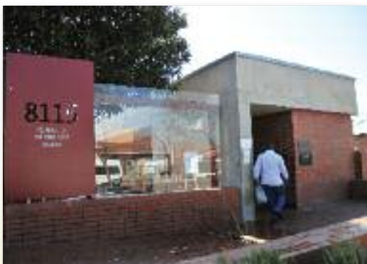
Home in Soweto