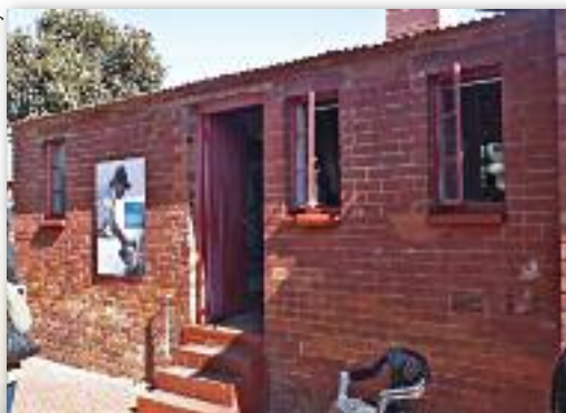
Mandela House in the Johannesburg township of Soweto was Mandela's home before his 27-year imprisonment, and his home immediately after being released from prison. The property is now a national museum.