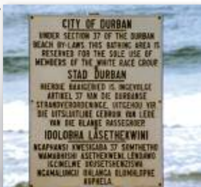
Sign reserving a Natal beach "for the sole use of members of the white race group", in English, Afrikaans, and Zulu