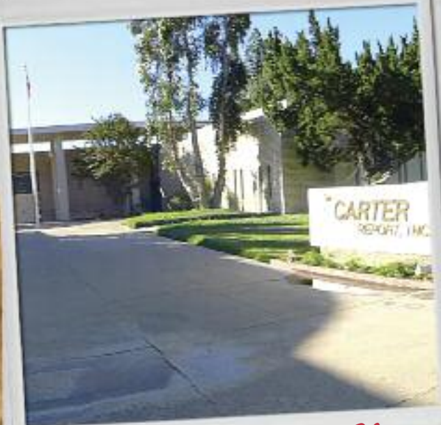
"Good Bye" to Arcadia, CA