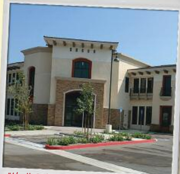
"Hello" to our new evangelism center, Moorpark, CA