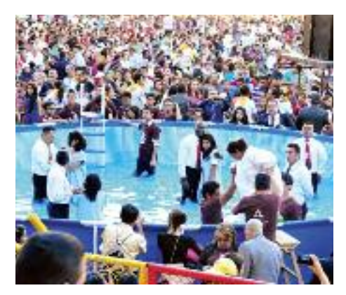
want to share His Good News. GLORY BE TO GOD!

has four times more people). What has just happened in Central America shows what Jesus can do when His people have a hunger for God and passionately