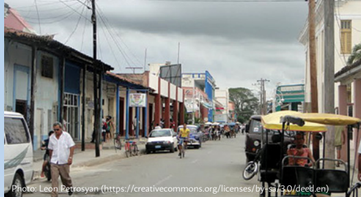
Ciego de Avila