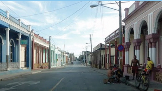
Main Street in front of Post Office, Guantánamo