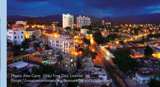
Santiago de Cuba