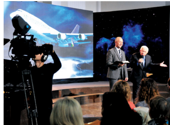
Hope TV Ukraine broadcast the messages into 6,400,000 homes.